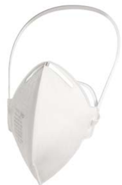
Dräger X-plore® 1750 N95

The specially developed CoolSAFE™ filter material combines various high-performance filter media to achieve an excellent filter performance. Coarse and fine particles are effectively stopped in the various filter layers. At the same time, the breathing resistance remains very low, allowing the user to work easily and without tiring for longer periods.