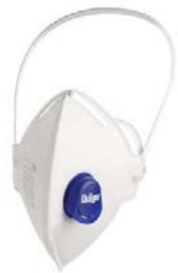
Dräger X-plore® 1700