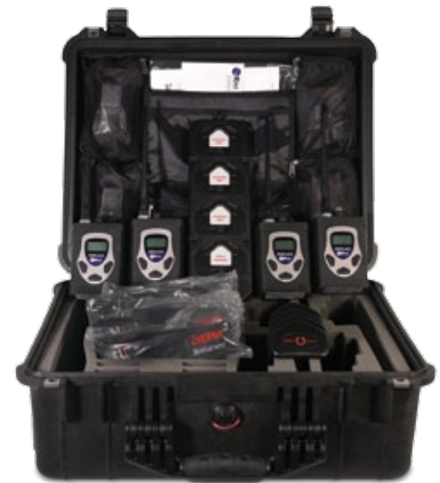
BioHarness Team Kit

Öã cã cãÁ K 0E0Q c} aã } aQ & ÚUÁ cÁ JI ÁÖ T [ cÁ QÁ î HF€ ì €€ì GÈGHÁÁGFJÈì Èì G æÁ CFJÈì Èì G ÁÁ æ• O æ&ã dÈ { . . . È&ã dÈ { Á