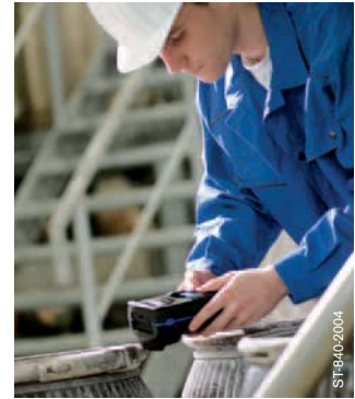
Dräger CMS: Spot measurement at industrial workplaces.