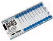
Dräger CMS: Highly accurate and easy to use.