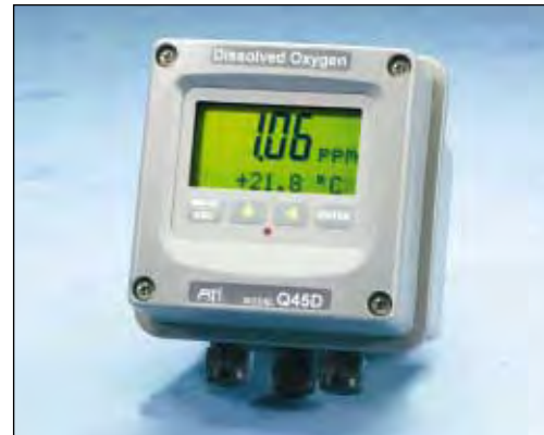
Dissolved Oxygen Monitor

When sensor maintenance is required, our cartridge-based sensor makes it fast and easy. Where other manufacturers make you throw away the cartridge, we've made our cartridge field-repairable. We also include enough replacement parts to rebuild your cartridge ten times. When you consider the average cost of a competitor's cartridge at $125, ATI can save you thousands of dollars in maintenance costs.