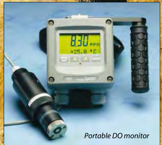
Portable DO monitor