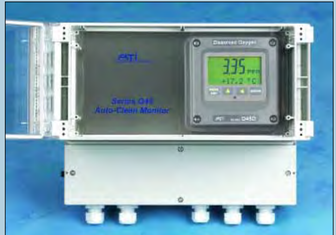
The Auto-Clean DO Monitor

Enter ATI's Auto-Clean D.O. Monitor, the first D.O. monitor to clean itself with air. Biological growth and other contaminants are literally blasted from the Teflon membrane. The result: reduced maintenance, better performance, and more accurate D.O. monitoring.