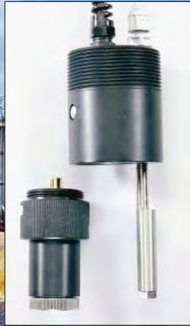
Replaceable sensing module

The NEMA 4X monitor and cleaner package may be wall mounted or connected to a standard handrail using vertical supports supplied as part of a handrail mounting kit. If desired, the DO monitor may be located up to 1,000 feet away from the cleaning system, which is always located within 50 feet of the sensor.