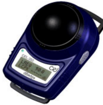
CEL-350 dBadge micro noise dosimeter

The CEL-350 is a completely new interpretation of the classic noise dosimeter. It has all the advantages of earlier badge designs such as small size and light weight and yet it still provides all of the benefits that users have come to expect from a traditional noise dosimeter. Fully featured and able to satisfy all current noise at work measurement protocols during a single run the CEL-350 will be an ideal instrument for experienced and new user of dosimeters in the workplace. No setup to worry about since the unit stores all results for later investigation and reporting however required.