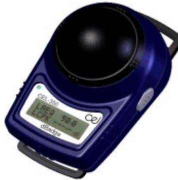
CEL-350 dBadge micro noise dosimeter

The CEL-350 is a completely new interpretation of the classic noise dosimeter. It has all the advantages of earlier badge designs such as small size and light weight and yet it still provides all of the benefits that users have come to expect from a traditional noise dosimeter. Fully featured and able to satisfy all current noise at work measurement protocols during a single run the CEL-350 will be an ideal instrument for experienced and new user of dosimeters in the workplace. No setup to worry about since the unit stores all results for later investigation and reporting however required.